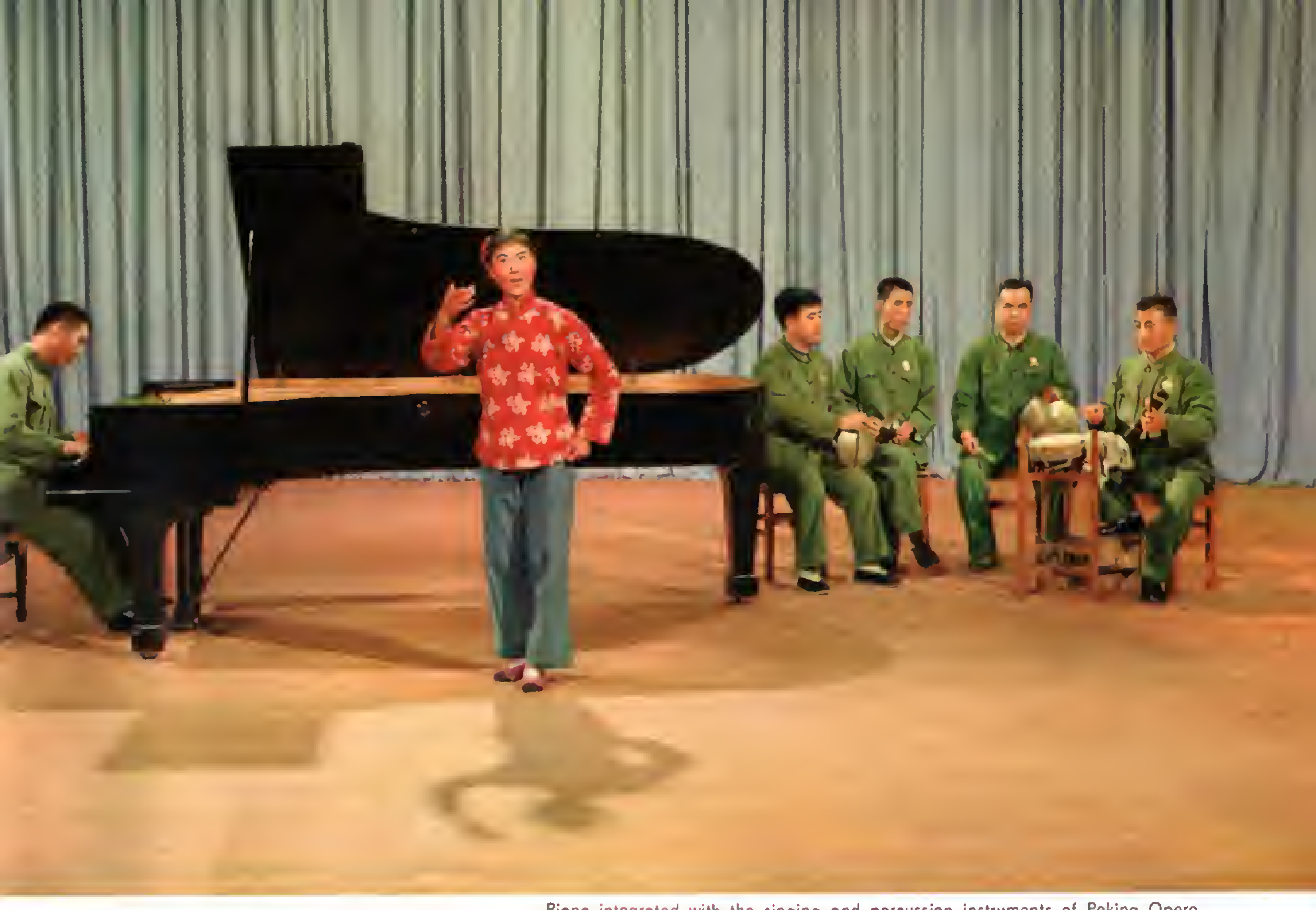
Piono integrated with the singing and percussion instruments of Peking Opera.